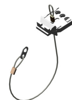
ATL Lock-Out Clip